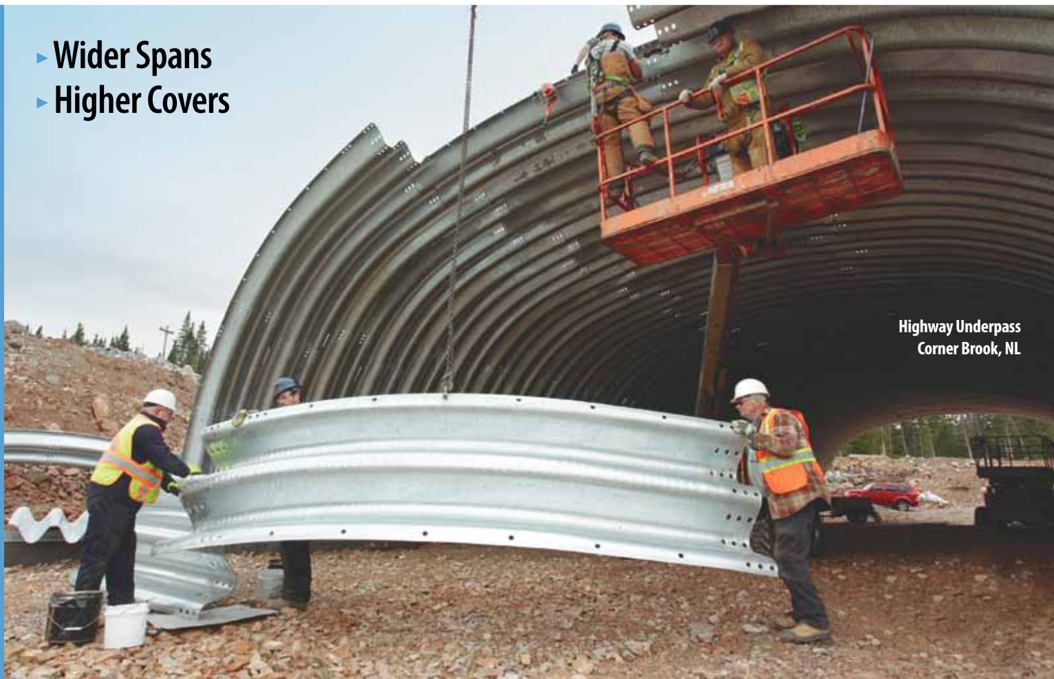
Highway Underpass Corner Brook, NL