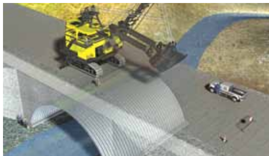
Strong enough to support today's largest mine equipment.